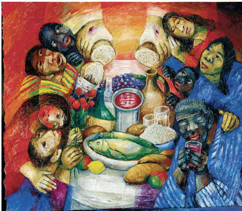
"Das Mahl" aus dem Misereor-Hungertuch "Hoffnung den Ausgegrenzten" von Sieger Köder © MVG Medienproduktion, 1996