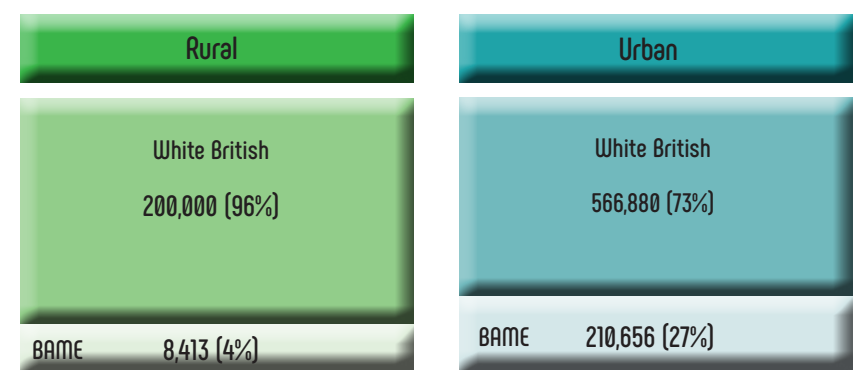
BAME - Black, Asian & Minority Ethnic