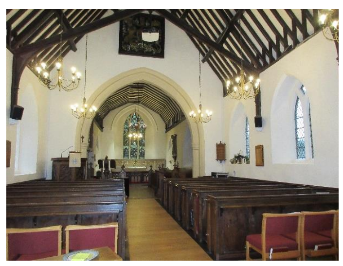
Looking east towards the chancel

PCC meetings are now held in the church. We have prayer breakfasts.