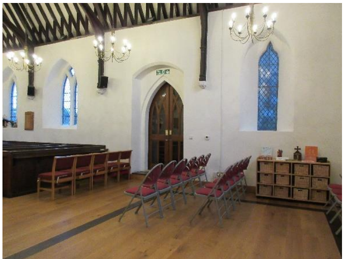
New flexible space at the west end

The Church of St Bartholomew, Kirby Muxloe