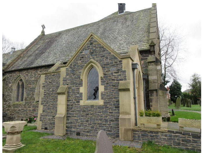
Porch design sympathetic to the historic building