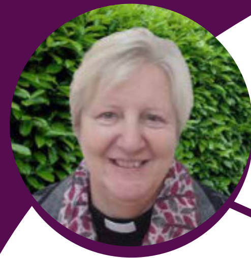
Venerable Claire Wood Archdeacon of Loughborough