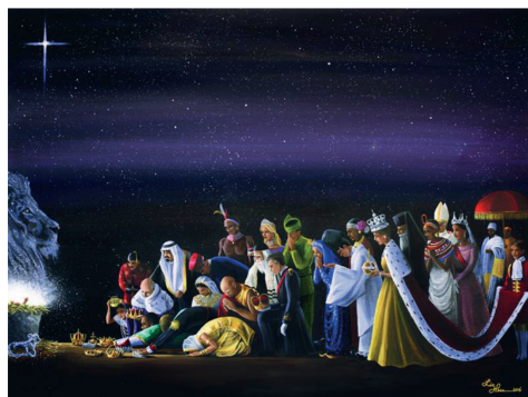
King of Kings by Liz Hes