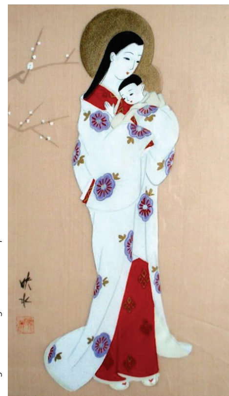
Mary with Child by an unknown Japanese Artist